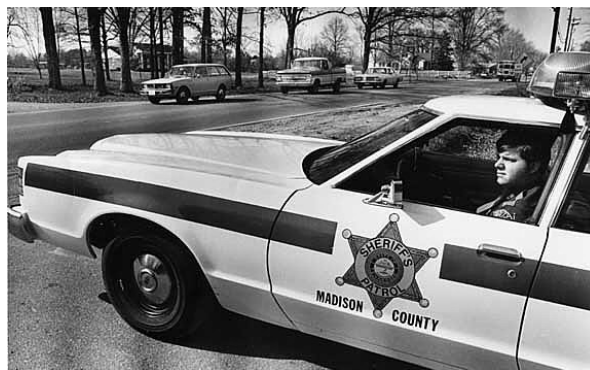
Madison County Sheriff's Patrol Car 1978

THE UNIVERSITY of TENNESSEE UT COUNTY TECHNICAL ASSISTANCE SERVICE