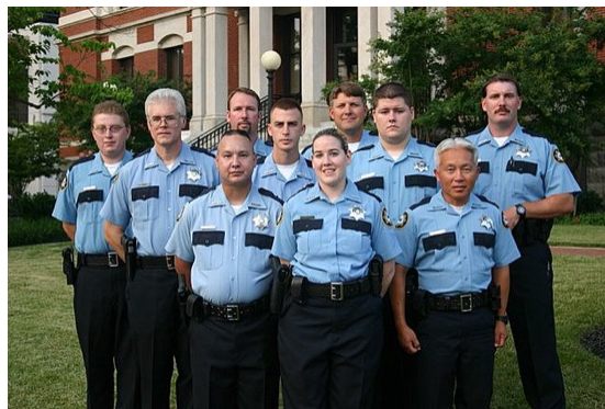
Montgomery County Sheriff's Office Reserve Officers

THE UNIVERSITY of TENNESSEE UT COUNTY TECHNICAL ASSISTANCE SERVICE