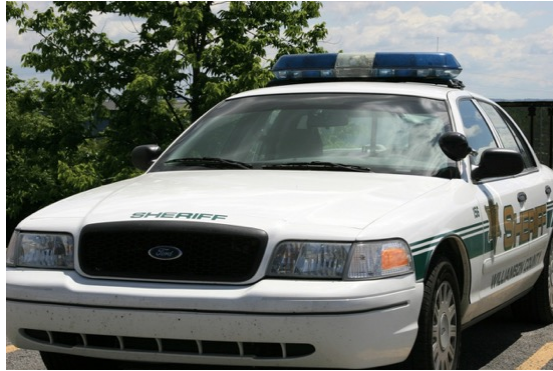
Williamson County Sheriff's Patrol Car 2006

THE UNIVERSITY of TENNESSEE UT COUNTY TECHNICAL ASSISTANCE SERVICE