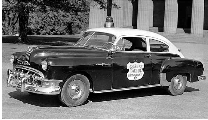
Davidson County Sheriff's Patrol Car 1950

THE UNIVERSITY of TENNESSEE UT COUNTY TECHNICAL ASSISTANCE SERVICE