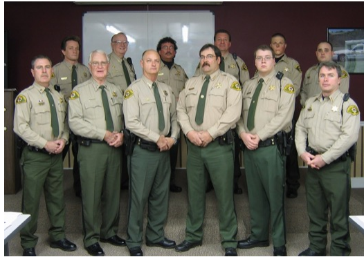
Williamson County Sheriff's Office Reserve Officers

THE UNIVERSITY of TENNESSEE UT COUNTY TECHNICAL ASSISTANCE SERVICE